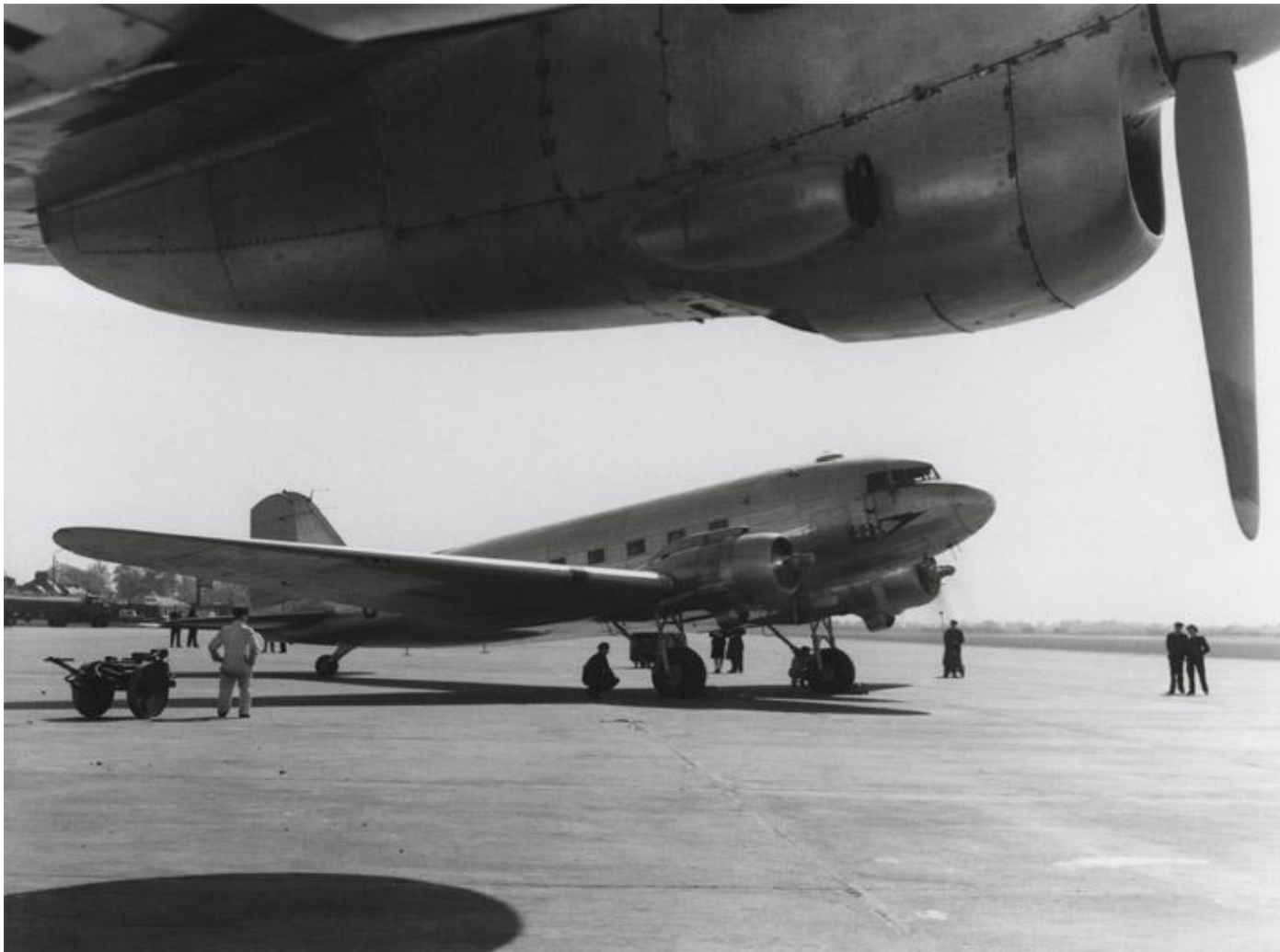
BOAC DC-3, seen from under the wing of a BOAC Avro York