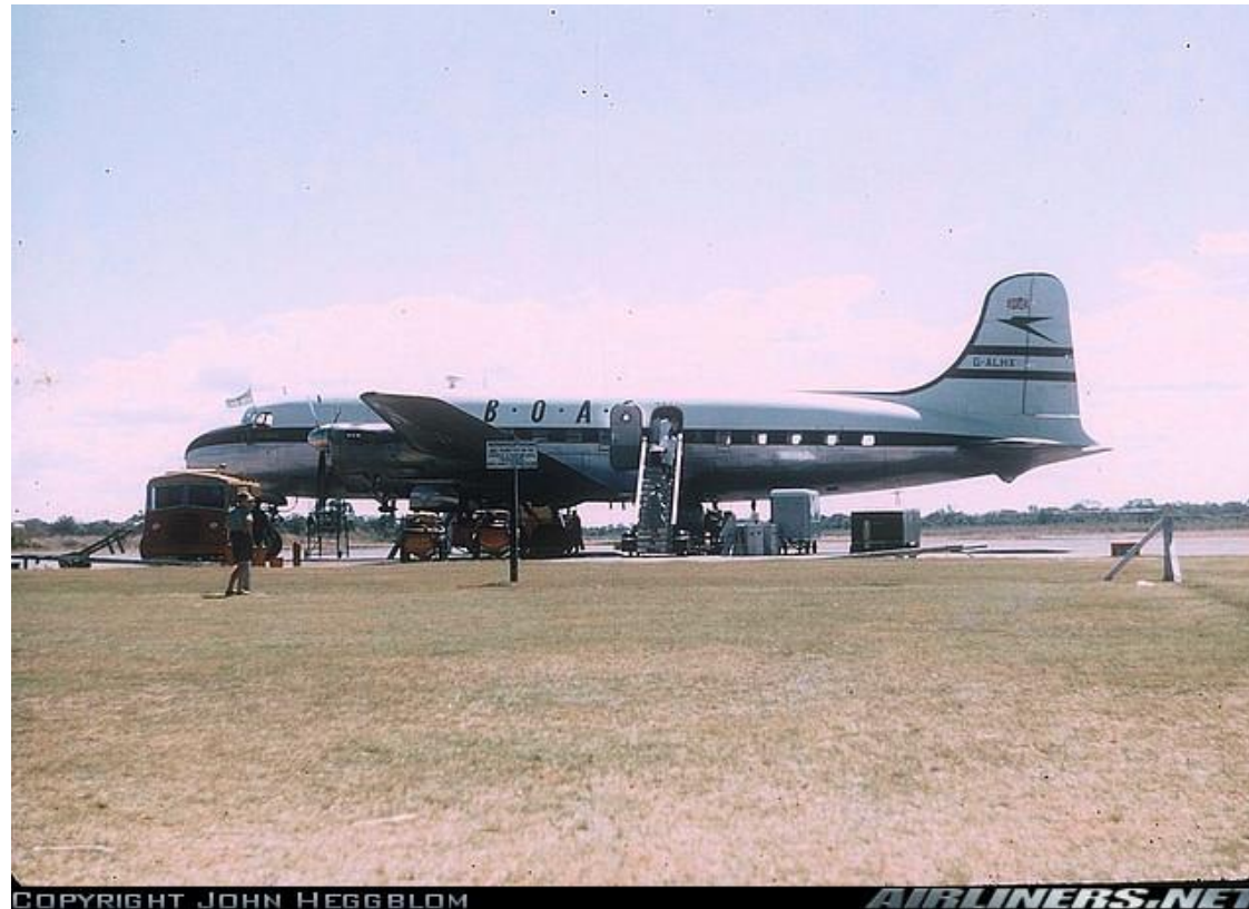
A BOAC Argonaut G-ALHX 'Astraea' at Livingstone , Zambia (then Northern Rhodesia)

The more powerful Rolls-Royce Merlin engines of 1,760 hp, compared with DC-4's Pratt & Whitney R-2000 engines of 1450hp and pressurisation, gave the Argonaut a higher cruising speed of 282 knots versus 197 knots and a service ceiling of 36,000 feet versus 22,300