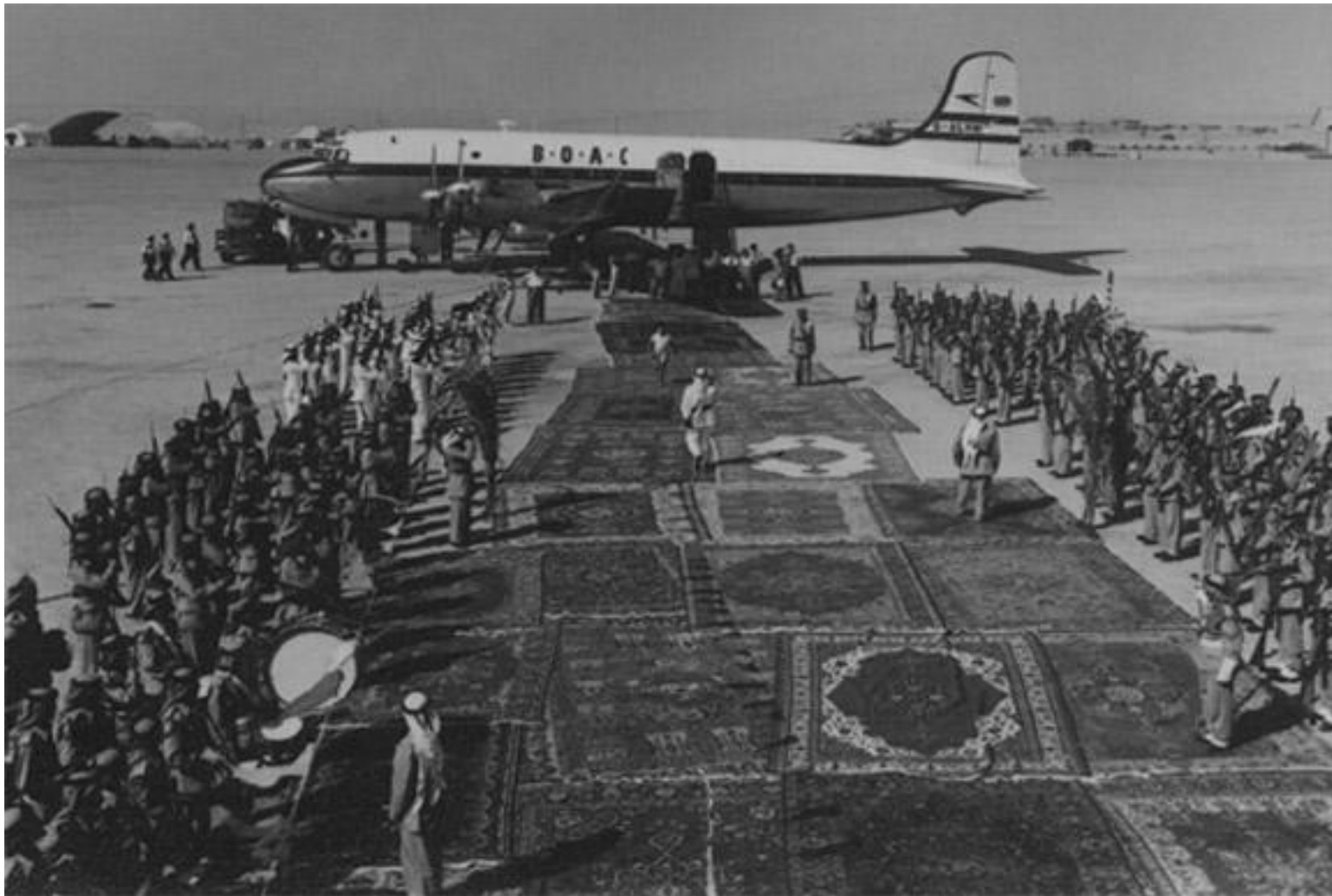
A VIP arrives on a BOAC Argonaut somewhere in the Middle East!