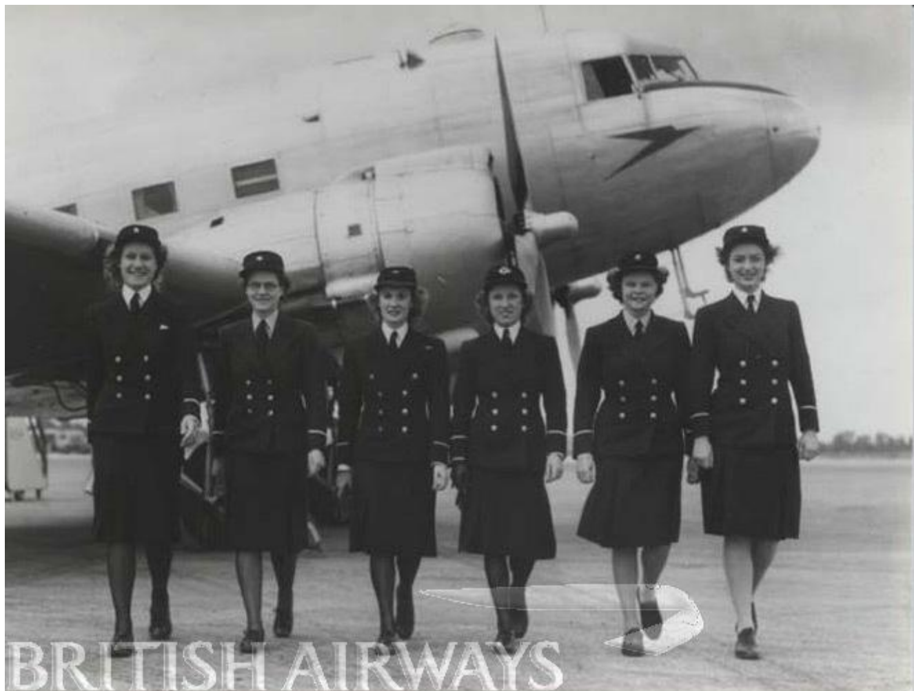
BOAC cabin crew in uniforms from the 1943-1946 period

BOAC's early baptism was operating scheduled services throughout the war years and indeed some aircraft and crews were moved between BOAC and the Royal Air Force, the crews changing uniforms in the process. The war provided its own challenges with nine aircraft being lost by bombing or being shot down. The route to Lisbon in neutral Portugal was flown throughout the war, where crews had the odd experience of seeing Luftwaffe crews in the bars and restaurants of the neutral city. Alas on one such flight back from Lisbon to the UK the DC-3 was shot down by a JU88 whilst crossing the Bay of Biscay and all the crew and passengers including the English film star Trevor Howard were lost.