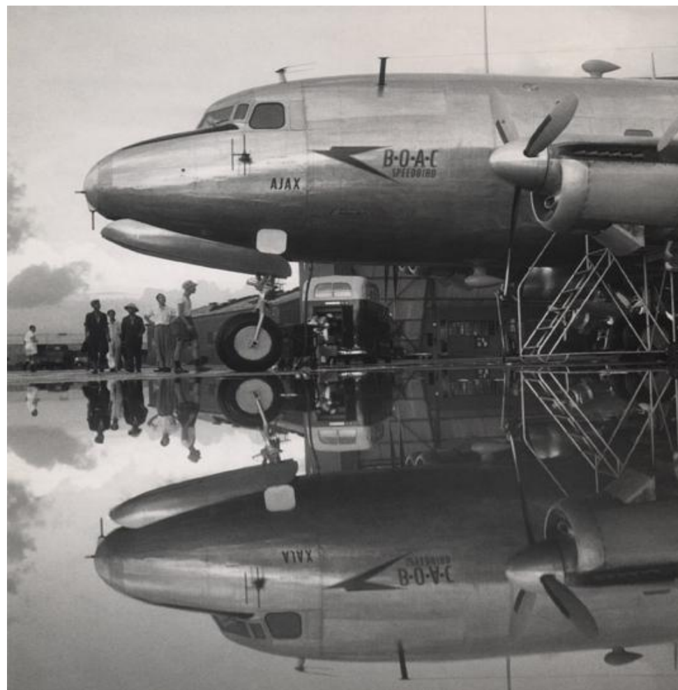
Canadair DC4M Argonaut G-ALHD Ajax somewhere hot and wet!